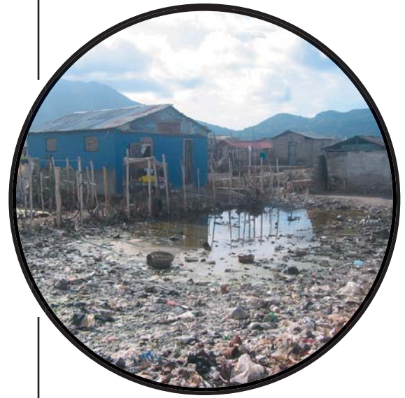
One of the poorer neighborhoods in Petite Anse, Haiti.